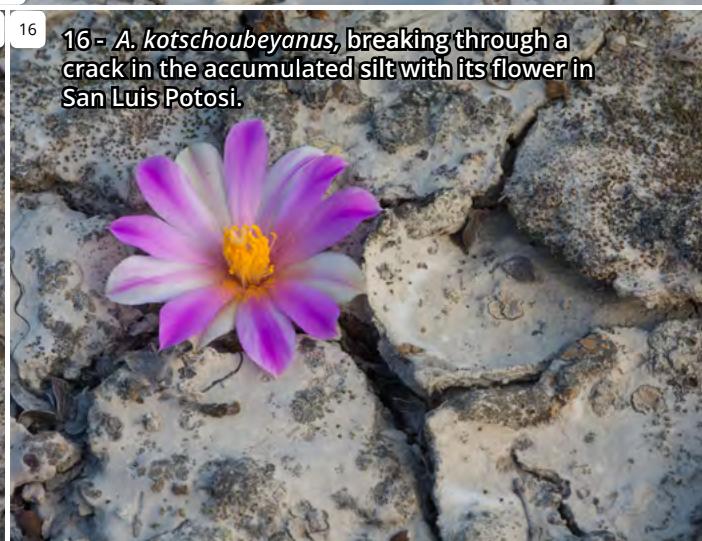
16- A. kotschoubeyanus , breaking through a crack in the accumulated silt with its flower in San Luis Potosí.