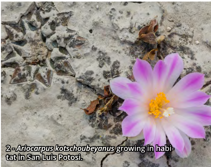
2- Ariocarpus kotschoubeyanus growing in habitat in San Luis Potosí.