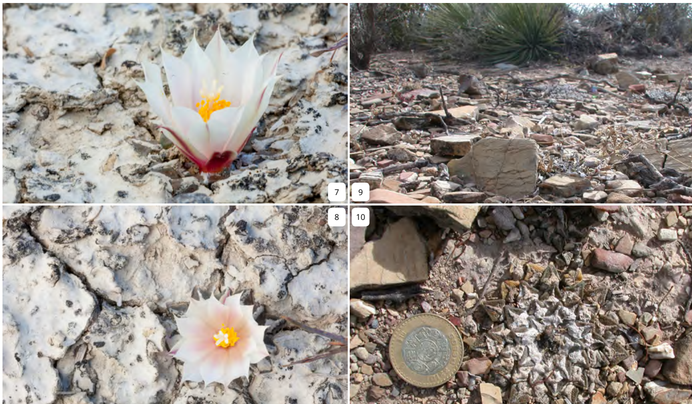
7 & 8 - A. kotschoubeyanus ssp. albiflorus , blooming in habitat near Tula, Tamaulipas. 9 - A. kotschoubeyanus ssp. elephantides , near Vista Hermosa, Querétaro, with a view of the gravelly habitat. 10 - A very large plant of A. kotschoubeyanus ssp. elephantides near Vista Hermosa, Querétaro. A comparison with a coin of 10 pesos, having a diameter of 25.5 mm is offered.