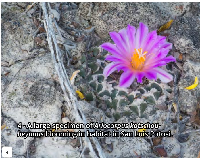
4 - A large specimen of Ariocarpus kotschoubeyanus blooming in habitat in San Luis Potosi.