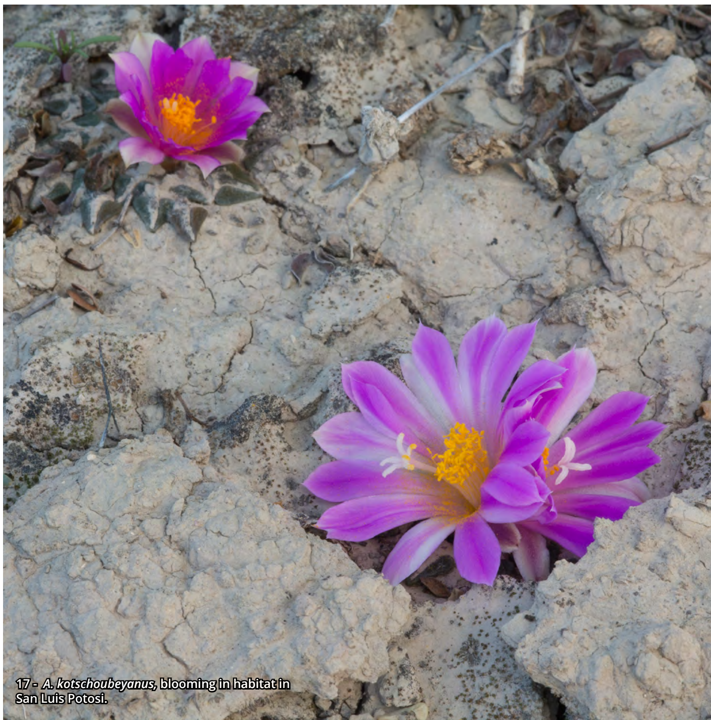
17 - A. kotschoubeyanus , blooming in habitat in San Luis Potosí.