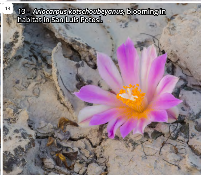
13 - Ariocarpus kotschoubeyanus , blooming in habitat in San Luis Potosí.