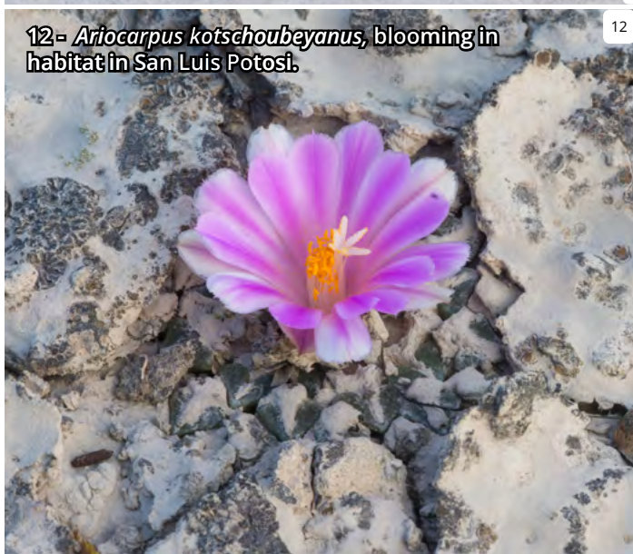
12 - Ariocarpus kotschoubeyanus , blooming in habitat in San Luis Potosí.