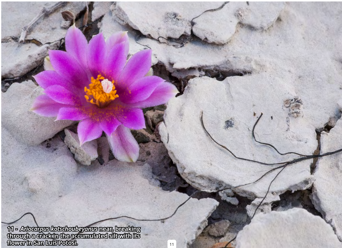
11 - Ariocarpus kotschoubeyanus near, breaking through a crack in the accumulated silt with its flower in San Luis Potosí.