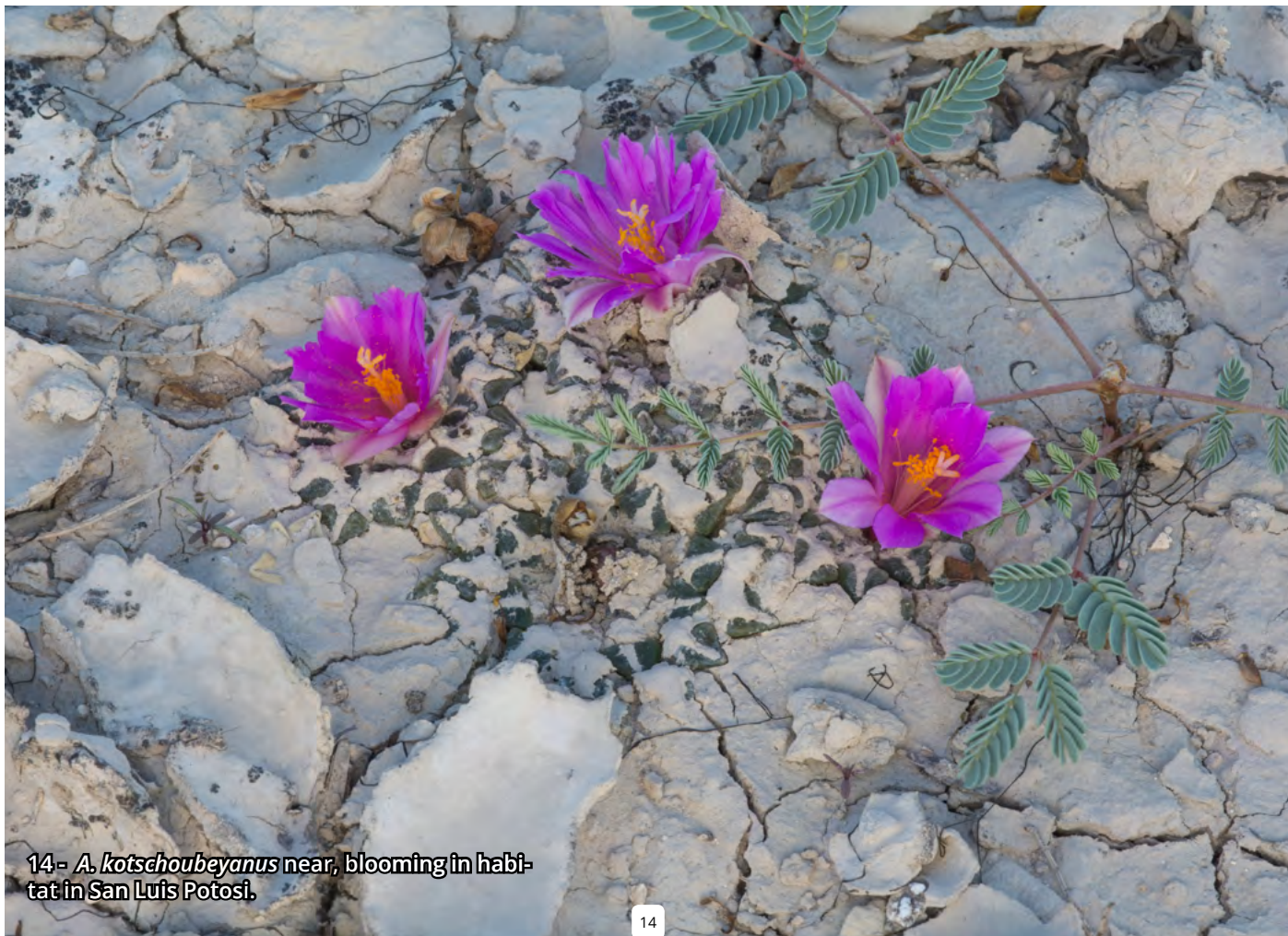
14- A. kotschoubeyanus near, blooming in habitat in San Luis Potosí.