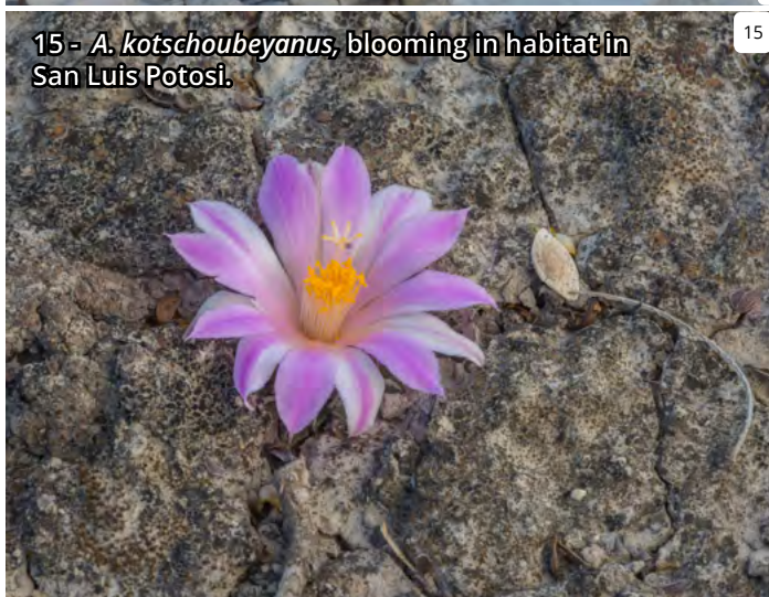
15- A. kotschoubeyanus , blooming in habitat in San Luis Potosí.