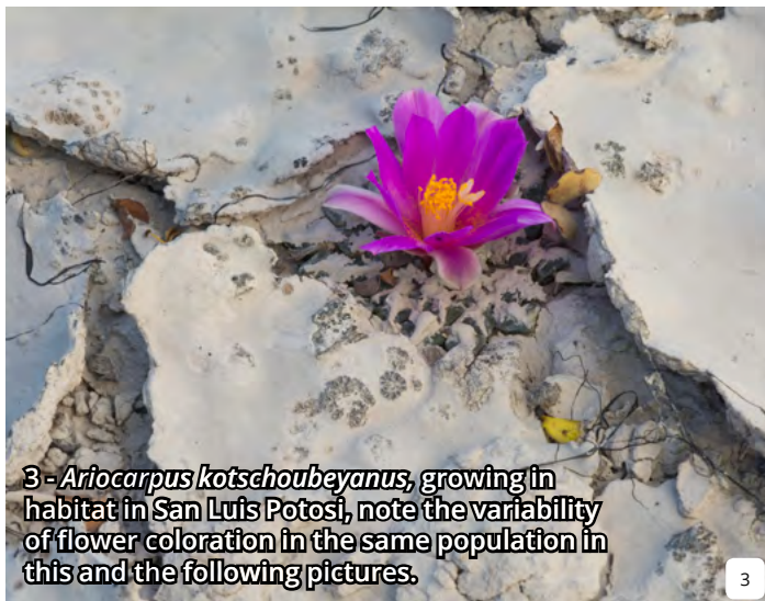
3 - Ariocarpus kotschoubeyanus , growing in habitat in San Luis Potosi, note the variability of flower coloration in the same population in this and the following pictures.