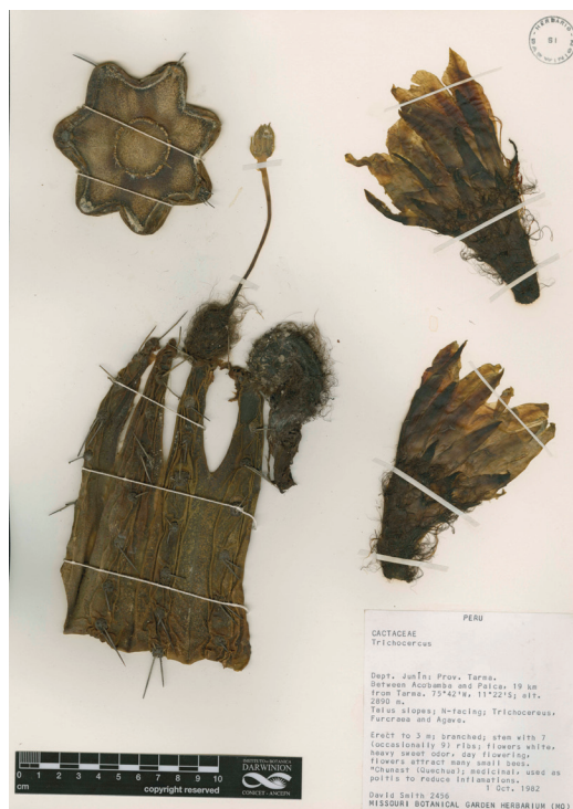
Fig. 5: Neotype of Trichocereus macrogonus as seen at the Tropicos website of the Missouri Botanical Garden; www.tropicos.org/Image/85856 on 30 Oct. 2011.

species under Echinopsis ; Krainz l. I. 1975 unpagued; Hunt 1992: 57, 138 and 1999: 190; Anderson 2001: 272 and 2005: 235) and in the horticultural literature (Rothers 1923: 44, 124; Schelle 1926: 19, 105; Petersen 1927: 32, 71; Kupper 1929: 66; Houghton 1931: 116; Backeberg and Knuth 1936: 203; Backeberg 1941; Backeberg 1959: 1119 and 1966: 438, inter alia; Ríha and Subík 1981: 180; Hunt 1989: 239; Innes 1990: 146; Mordhorst 2008: 218), as well as in trade catalogs (e.g., Haage 1927: 10 and 1938: 4, inter alia; Kreuzinger 1935: 38; Wenzel 1937: 4; Holly Gate Nurseries 1977/78: 4; Abbey Garden 1981: 38; Veg Saatzucht Zierpflanzen Erfurt 1979: 5; Köhres 1986: unpagued). These references demonstrate that the epithet macrogonus is still in use.