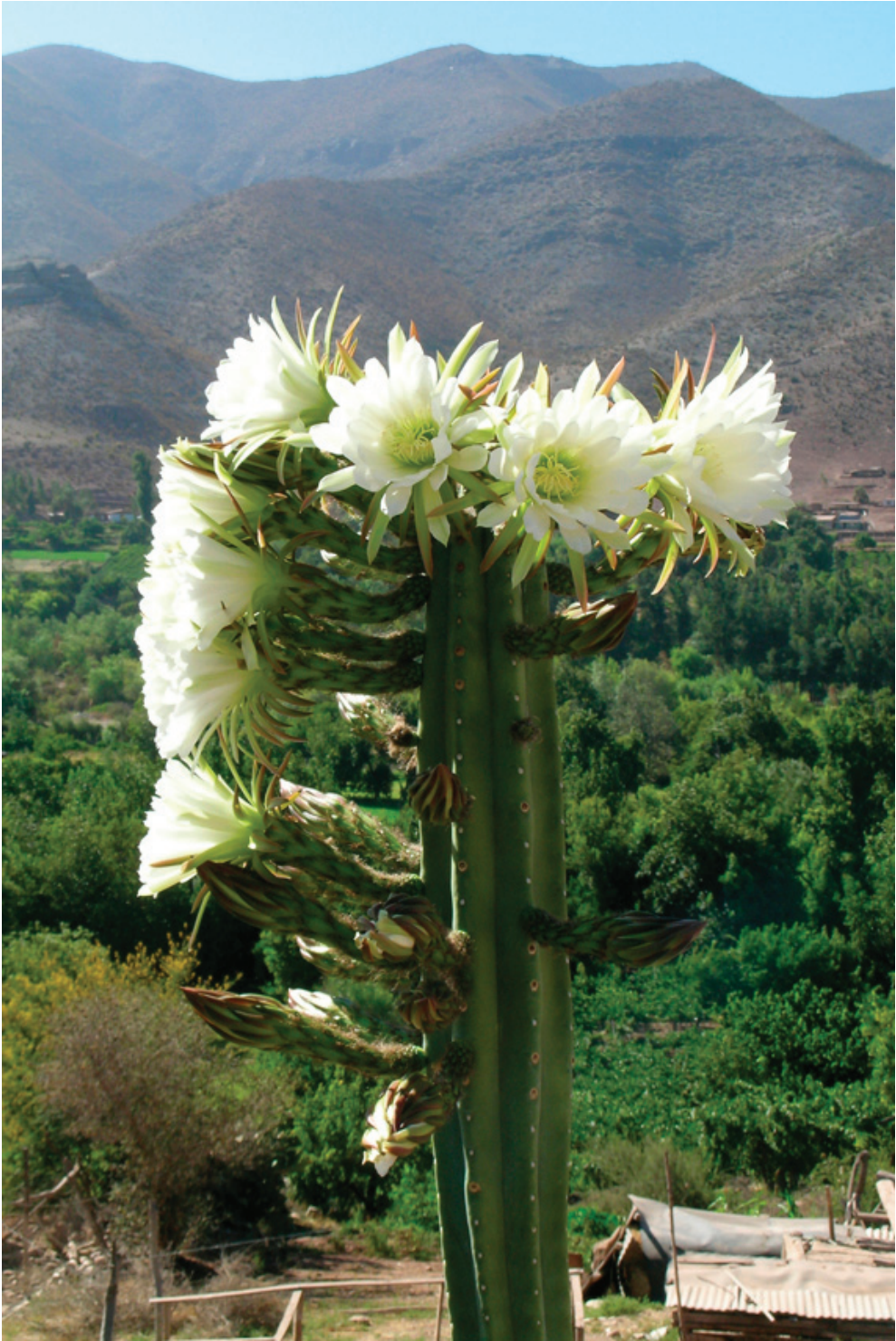
Fig. 4: Trichocereus macrogonus cultivated at a rural house in northern Chile (between Vallenas and Ovalle).