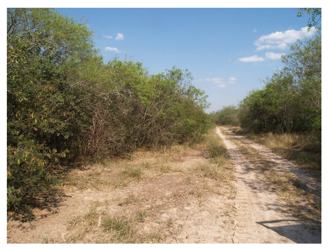
Figure 3. Typical woodland where Trichocereus hahnianus has been found.

difficult species to place generically", a circumstance already mentioned by Backeberg (1962) and true up to now, in spite of the great advances in scientific methods and knowledge. The stems resemble an Aporocactus, or some Selenicereus, although both are epiphytic and not terrestrial as M. hahnianus is. The flowers resemble Echinopsis more than Trichocereus, because the tube is thinner than the pericarpel and has only sparse hairs, although the buds are very hairy. The fruit is similar to that of Trichocereus because of the dense hair cover when young and the thick wall. Kimnach (1987) saw a similarity between the seeds of M. hahnianus and those of the genus Harrisia. According to our own observations, however, the seeds of M. hahnianus are much smaller than those of Harrisia and they don't have the cavernous hilum-micropylar-region typical for Harrisia seeds. The size of the seeds is comparable with the seeds of Trichocereus, but otherwise the similarity with the examined seeds of several Trichocereus species is not very high.