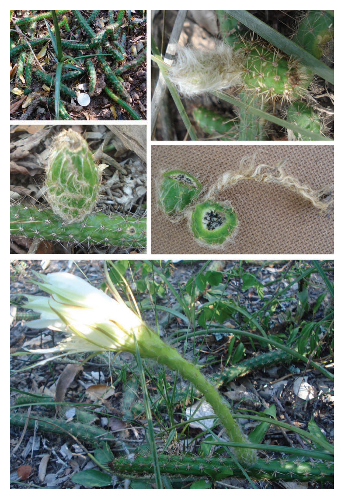
Figure 1. Trichocereus hahnianus as rediscovered in the wild. Top left, many rooted stems together with a Bromelia sp. (the coin is 23 mm in diameter). Top right: flower bud. Middle left: full fruit. Middle right: fruit cut transversely (fruit not collected; seed maturity unknown). Bottom: flower. Picture, \\s L.P. de Molas except top right, R. Kiesling.