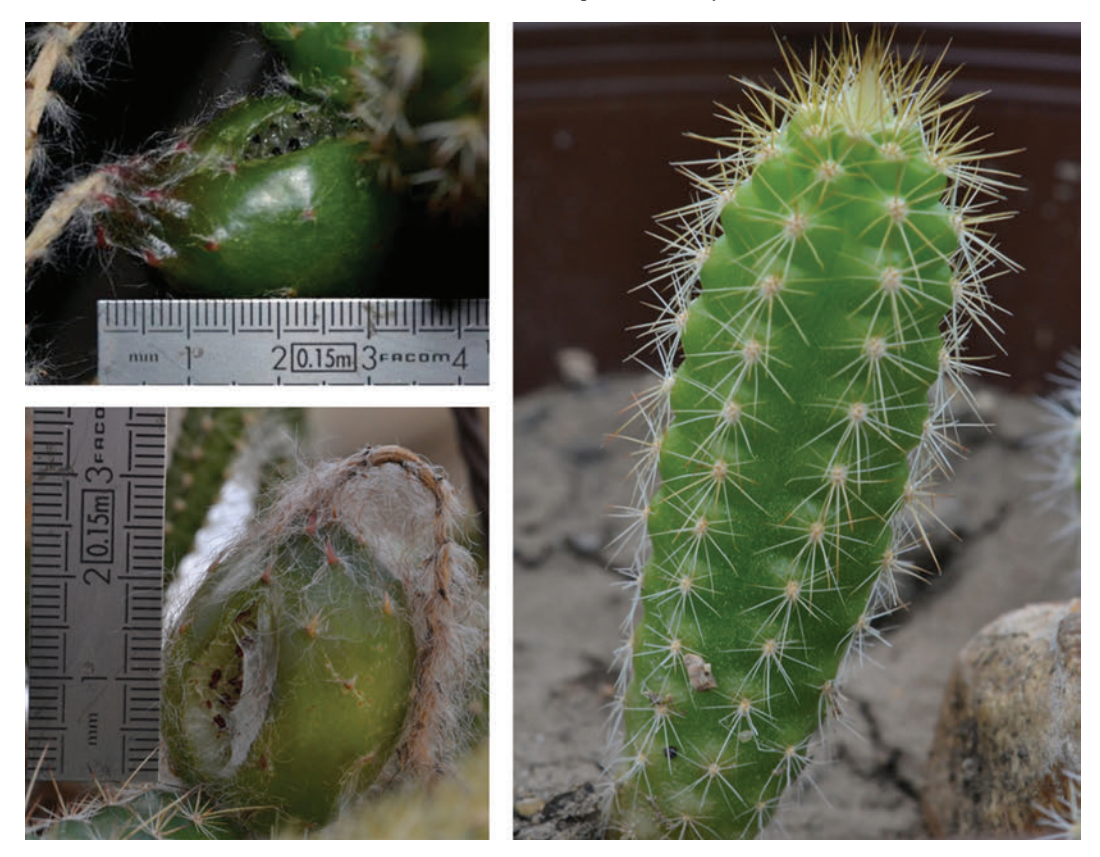
Figure 6. Left: longitudinally dehiscent fruit; top: HNT clone; bottom: new clone. Both clones pollinated with E. calochlora . Only the HNT clone has given viable seeds. Right: seedlings obtained from the HNT clone pollinated with E. calochlora ; 55 mm high, 18 mm in diam., 7 ribs, 9 months old. Cultivation and pictures, A. de Barmon