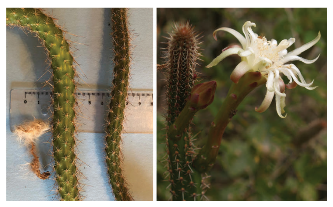
Figure 5. Left: comparison between the new Trichocereus hahnianus clone grown in full sun (left stem) and in the shade (right stem). Right: Monvillea cavendishii with the typical naked flower; the stem is thicker and spinier than T. hahnianus . However, without flower or fruit (red in M. cavendishii ) the two plants can easily be confused.